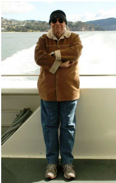
Some Tourists It really wasn't that cold? Cool but not cold.