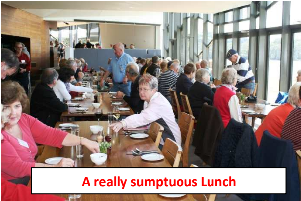
A really sumptuous Lunch