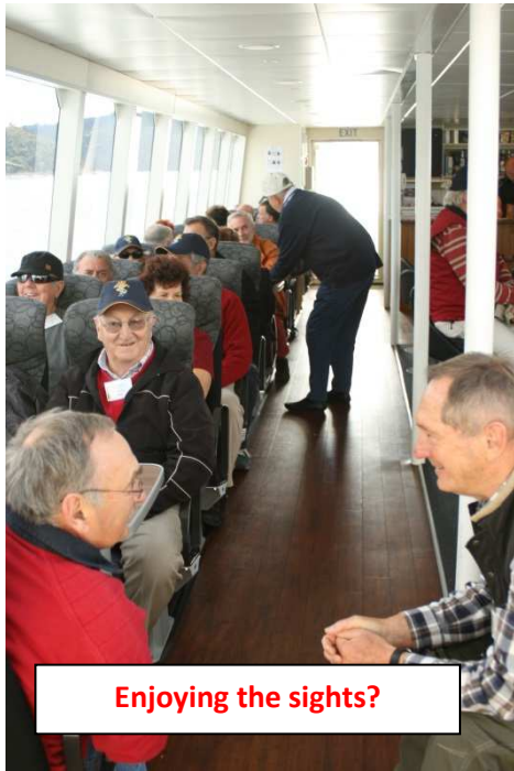
Enjoying the sights?