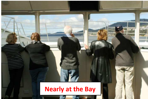
Nearly at the Bay