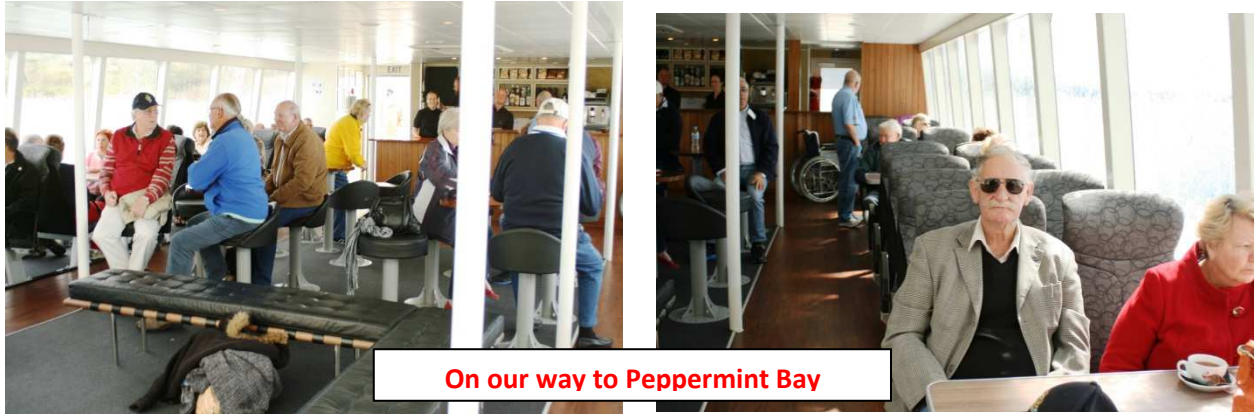
On our way to Peppermint Bay