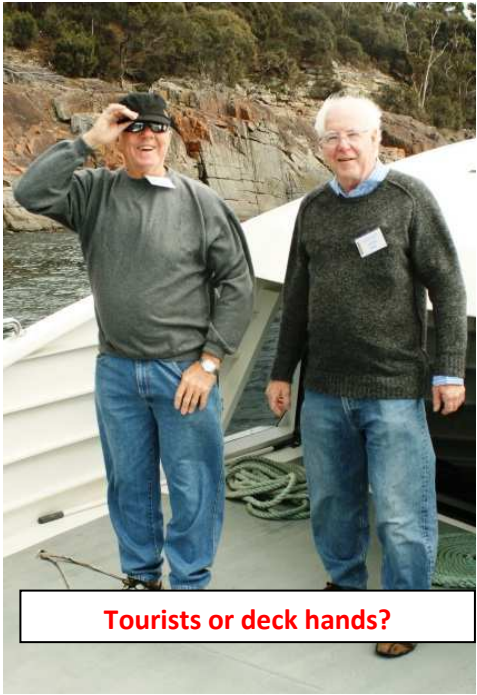
Tourists or deck hands?