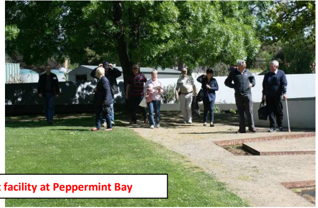
The grounds at the tourist facility at Peppermint Bay